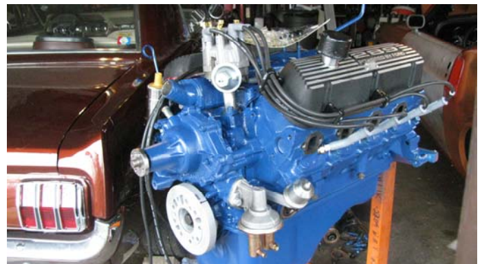
Nahlik's 66 Restore Project

3 1/2 weeks from Birmingham and here are pics from yesterday's progress on the 66's engine. Got it painted and some major parts back on. Still need to do the spark plugs and wires on one side, the exhaust manifolds, carburetor and misc other little stuff and then it will be going back in. Hopefully that will happen on March 22, 2009.