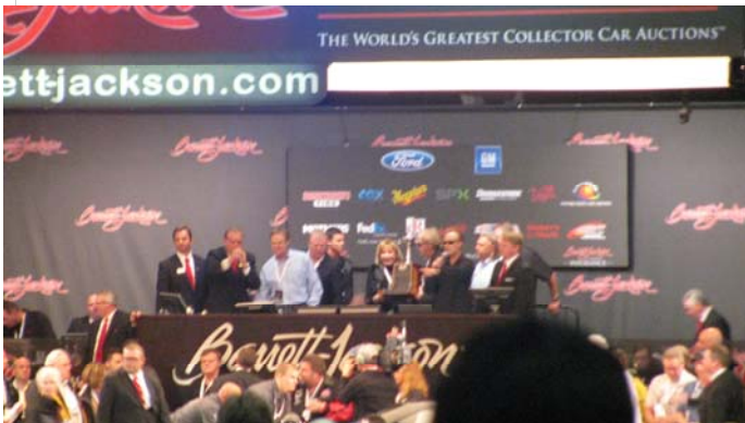
Rusty Wallace auctioning one of his race cars