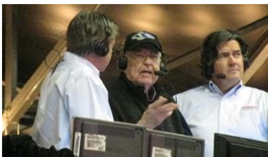
Carroll Shelby Interview