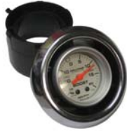
New Roush Vent Gauge Pod can be added to any 2005-2008 Ford Mustang

LIVONIA, Mich. (February 26, 2008) - True performance drivers want to know exactly what is going on with their vehicle at all times, but much of this detailed information is typically only available through supplemental gauges. But at a minimum, adding an accessory gauge increases clutter and decreases visibility around the dashboard, and typically requires some form of cutting or drilling into your valuable vehicle. The new ROUSH(r) Vent Gauge Pod is cleverly designed to integrate in the Heating, Ventilation and Air Conditioning (HVAC) vent of any 2005-2008 Ford Mustang (including the Shelby GT500) or 2004-2008 Ford F-150 truck. Installation is simple - just remove the HVAC air louvers by gently pulling outwards to remove. The ROUSH